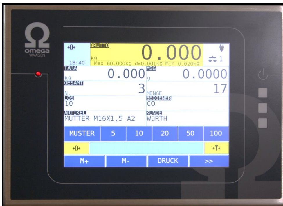
Figure 2 WA-08 indicator – front view.