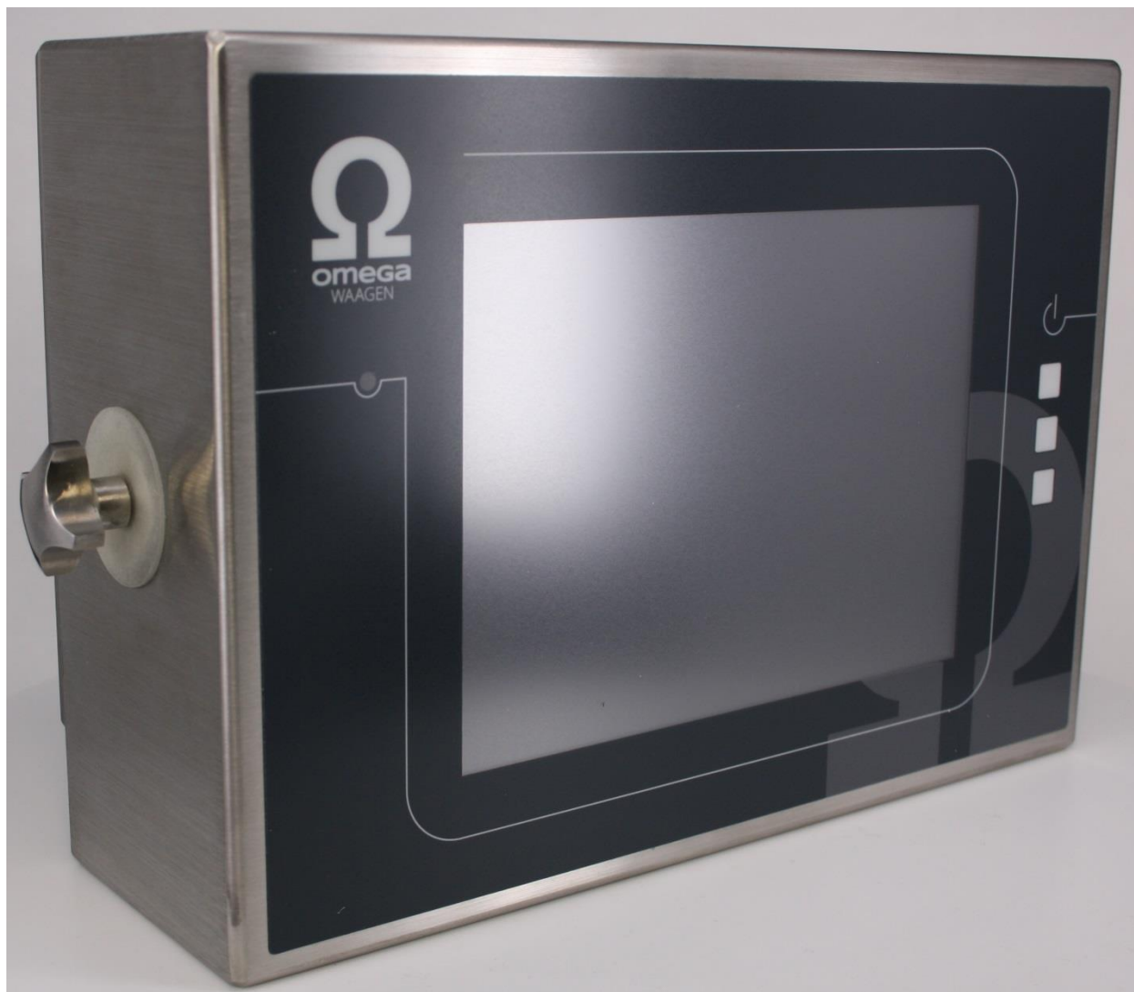
Figure 1 WA-08 indicator – enclosure example.