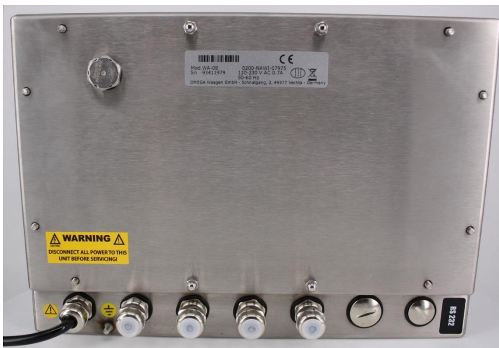
Figure 3 WA-08 indicator rear view.