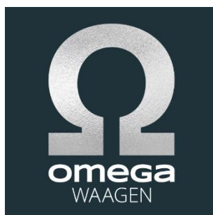
Figure 5 Trademark of OMEGA Waagen to be placed on the scales.