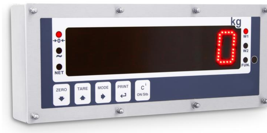
Figure 3 WA-03 secondary display.