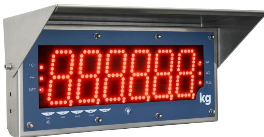
Figure 4 WA-03 secondary display.