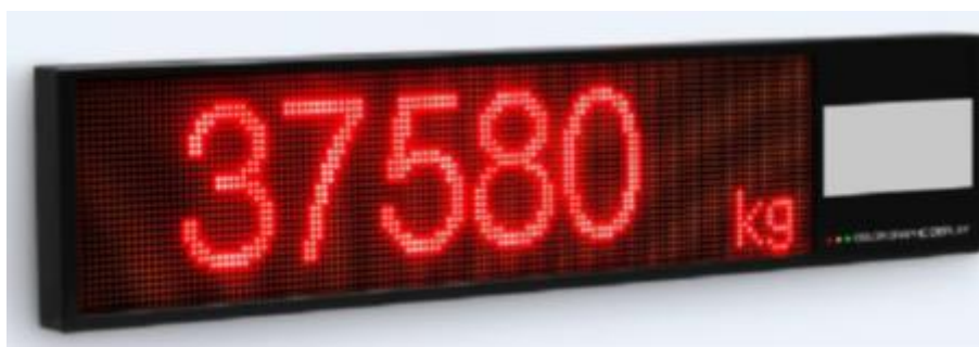
Figure 2 WA-03 secondary display.